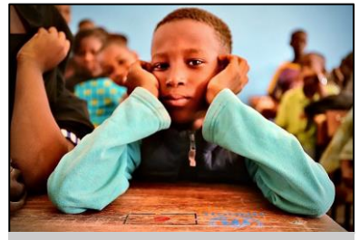
Student in a new classroom in Timbuktu, Mali

In Mali, three new fully equipped classrooms have been handed over this month